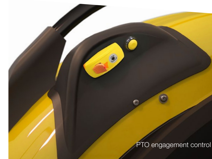
PTO engagement control